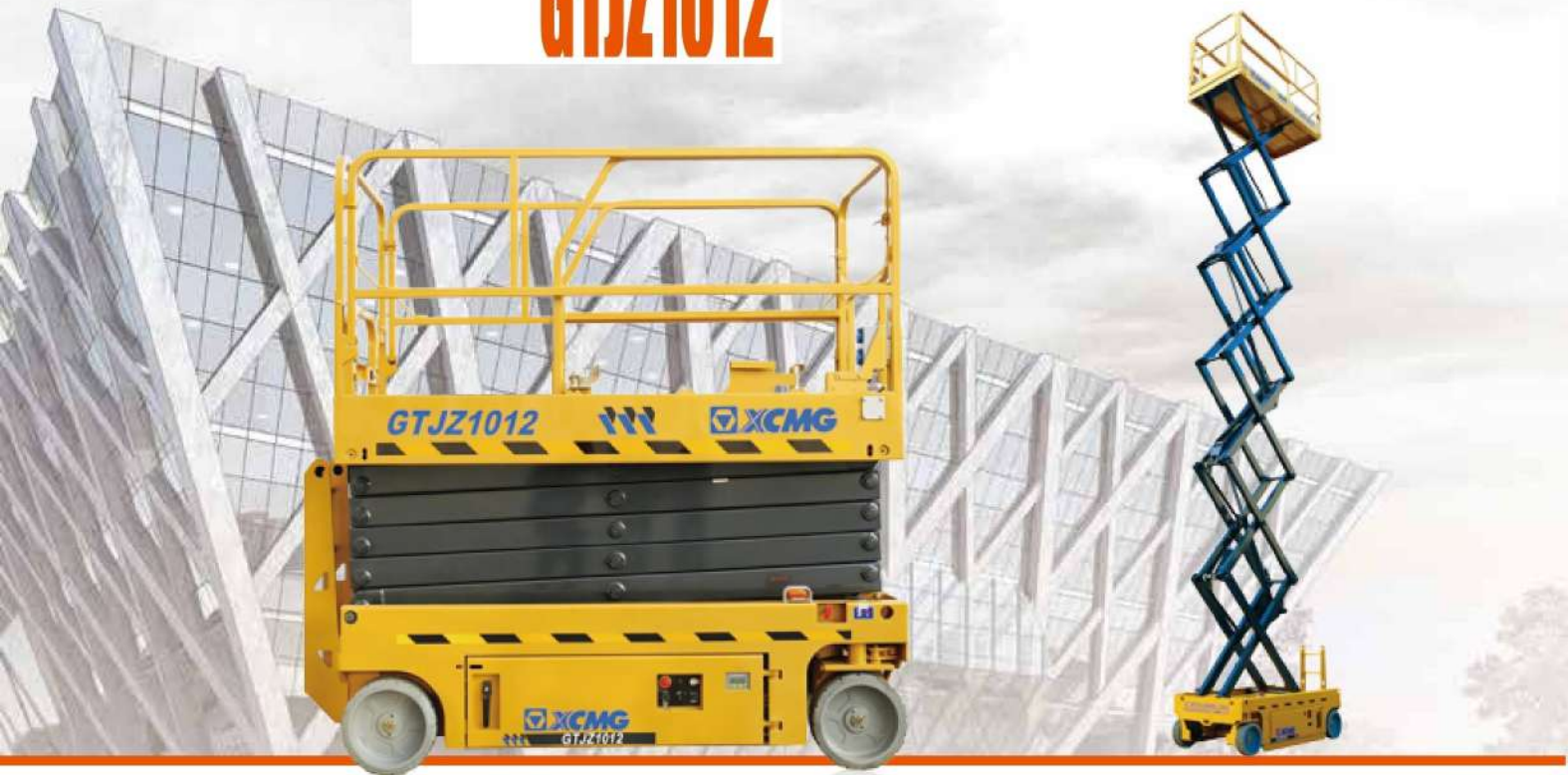
Parameters Table (Technical Specifications)